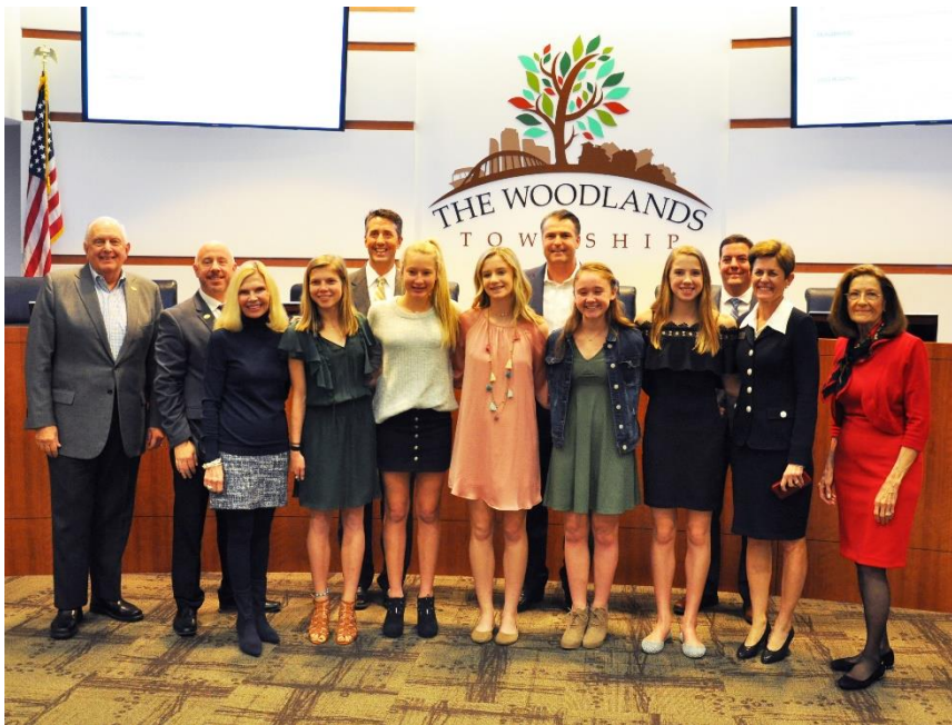
The Woodlands Township Board of Directors recognized The Woodlands Christian Academy Girls' Cross-Country Team for winning a State Championship.